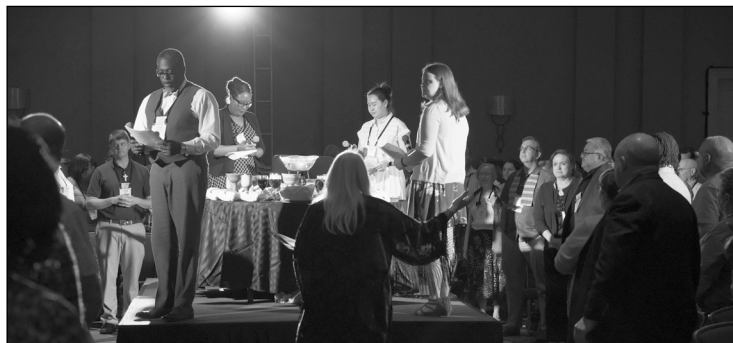
Conference members come together around the Communion table at opening worship.