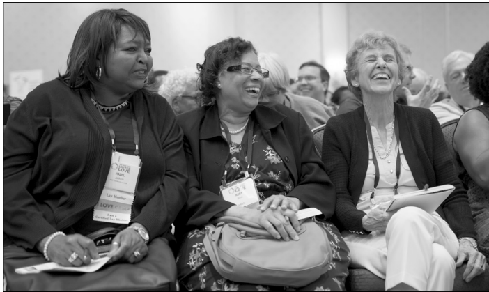
The laity gather for laughter and learning Wednesday afternoon.