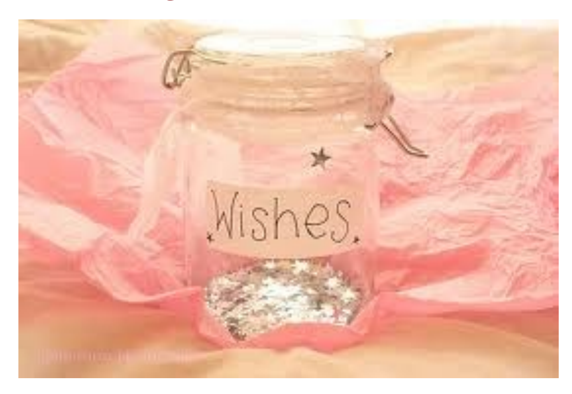
ANNOUNCING... The SWH Housewarming Wish List Campaign!! June 15th through August 15th

Bringing Beauty, Continuity and Expressions of Caring to Susanna Wesley House Residents