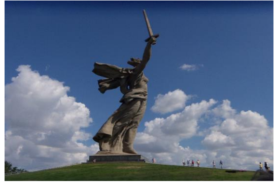
The statue of Mother Russia taken in Volgograd, Russia. It is the second tallest statue in the world. Picture 1.