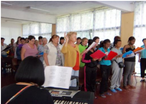
International UMW of Russia Conference members singing praises to God.