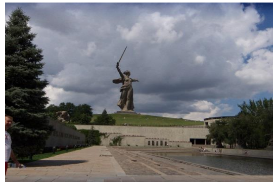
The statue of Mother Russia taken in Volgograd, Russia. It is the second tallest statue in the world. Picture 2.