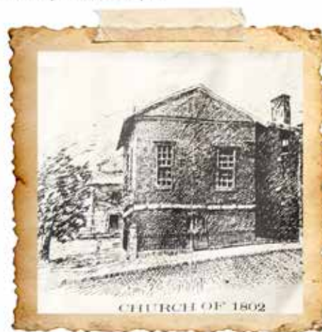
Sharp Street Church in 1802