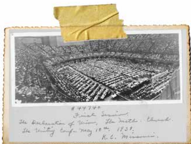
At the 1939 Conference, the racially segregated Central Conferences were created