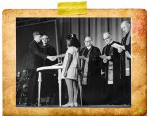
Children cement the union of the Methodist Episcopal and Evangelical United Brethren churches in 1968