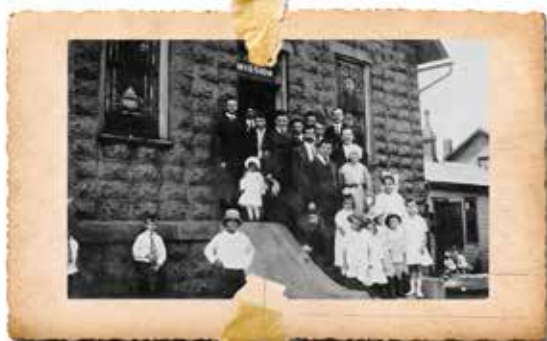
Methodists created Sunday Schools to help children learn about faith, basic reading, writing, and arithmetic