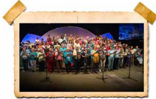
Clergy Women's Choir, 2014 Women's Assembly