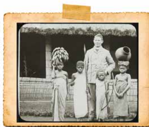
Methodist missionaries took the Gospel to Africa