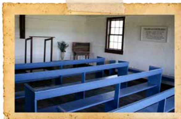
Meeting House at Strawbridge Shrine