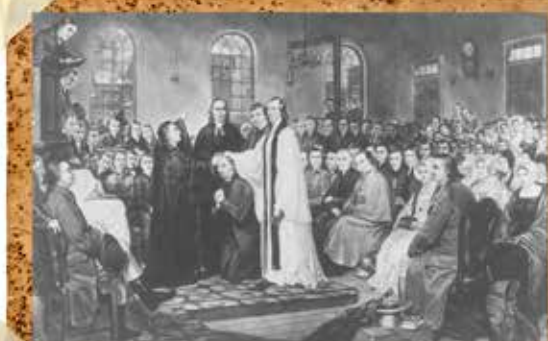
Drawing of the 1784 Christmas Conference at Lovely Lane Chapel in Baltimore, featuring the ordination of Francis Asbury