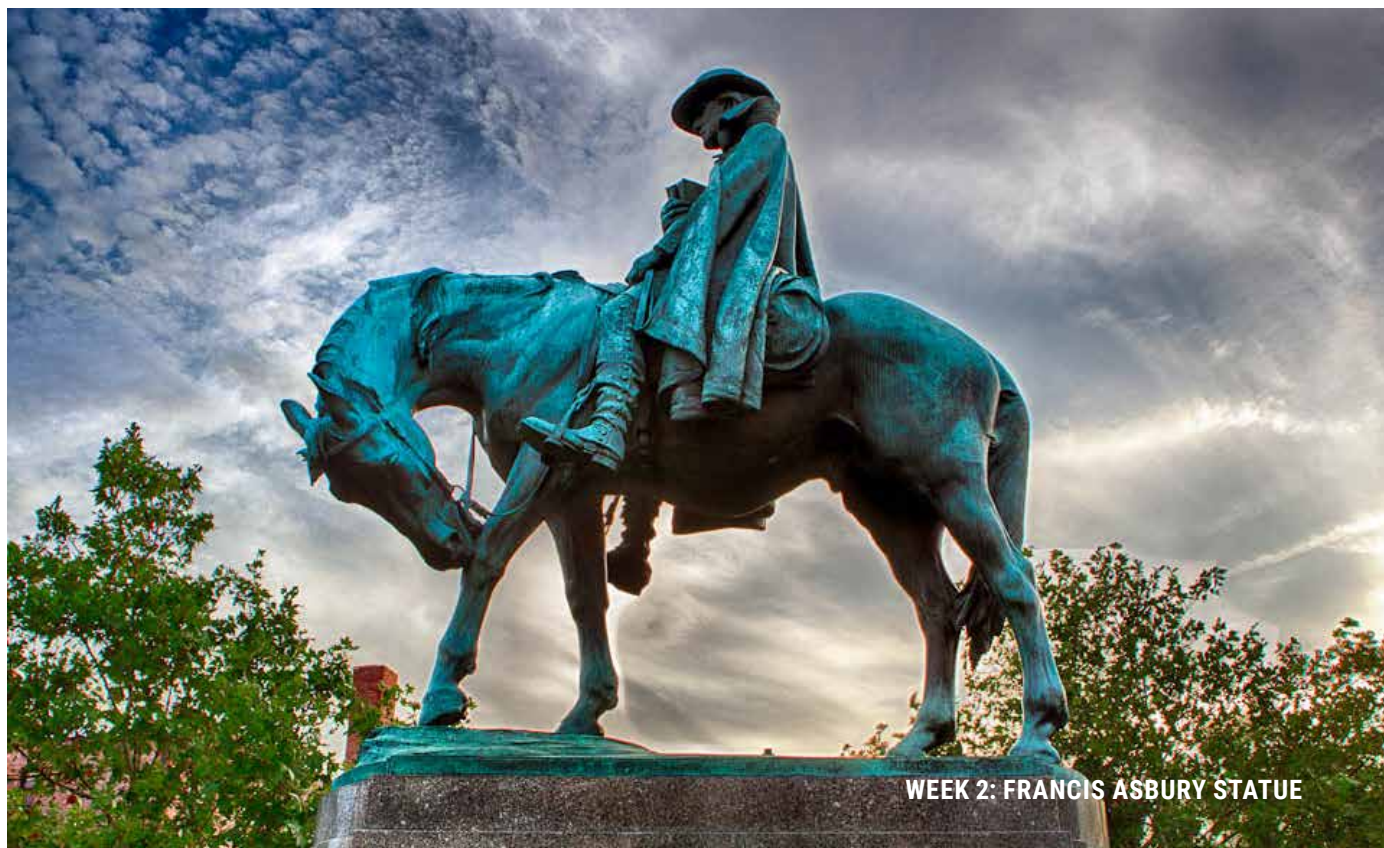
WEEK 2: FRANCIS ASBURY STATUE