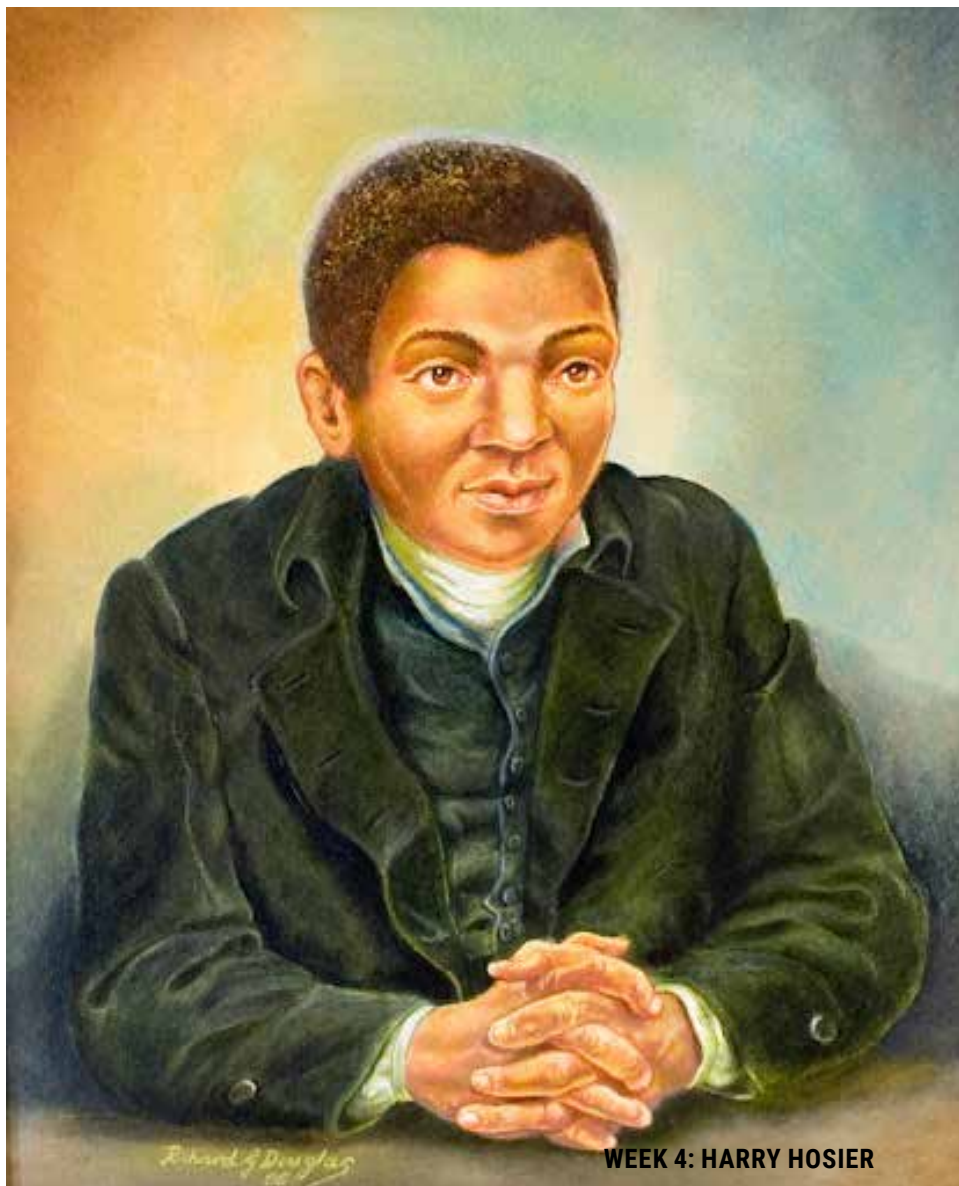
WEEK 4: HARRY HOSIER