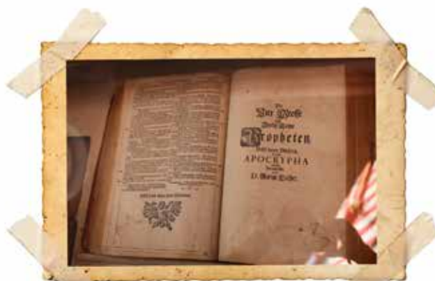
German Bible at Old Otterbein UMC in Baltimore