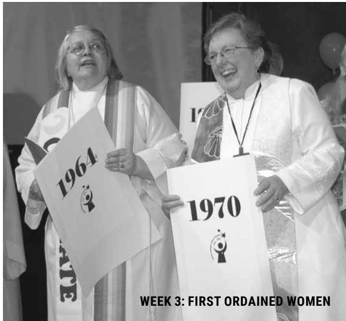
WEEK 3: FIRST ORDAINED WOMEN