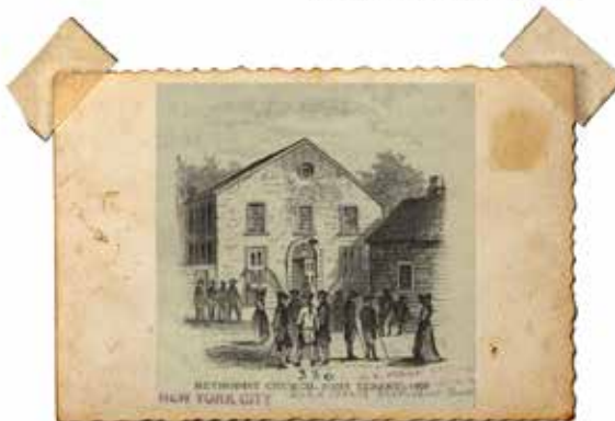
John Street Church in New York, one of the first black congregations