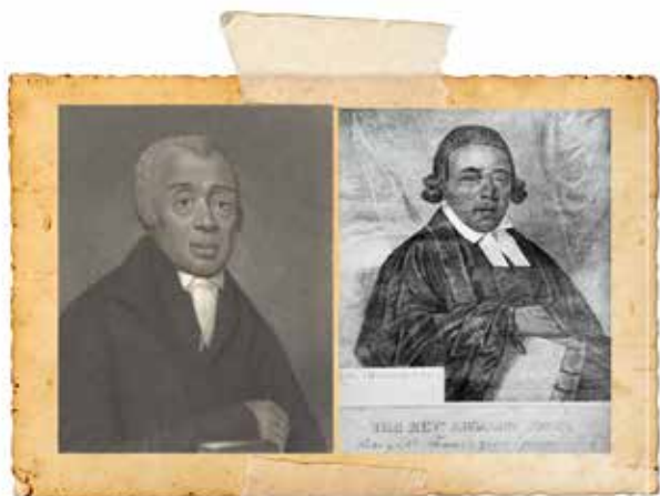
Revs. Richard Allen & Absalom Jones