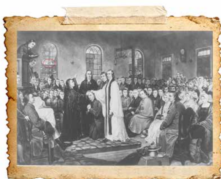
Harry Hosier, a preacher and traveling companion of Bishop Francis Asbury, circled above, attended the Christmas Conference