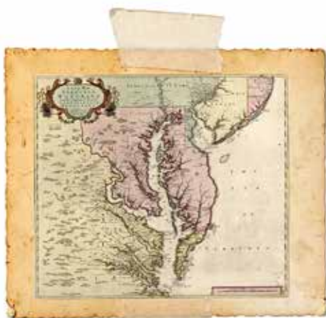
Colony of Maryland map, circa 1685