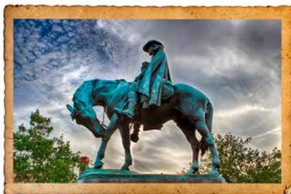
Statue of Francis Asbury located in Washington, D.C.