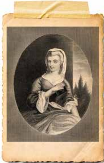
Susanna Wesley, mother of Methodism's founder, John Wesley