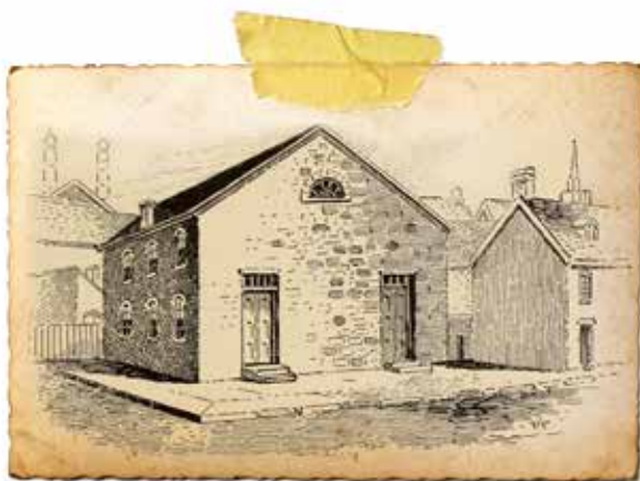
Original drawing of Lovely Lane Chapel