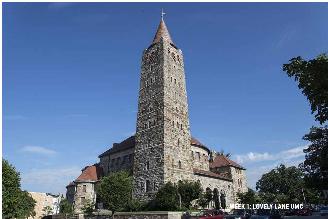
WEEK 1: LOVELY LANE UMC