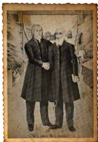
Philip William Otterbein & Martin Boehm