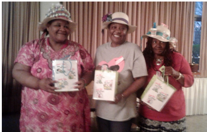
At the Women's Retreat, three winners of the Strawhat Decoration Contest show off their prizes for creating the most beautiful, the most creative and the funniest hats.