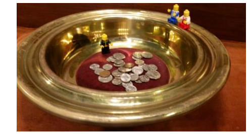
P articipate! Children learn to be passionate about worship by watching you worship.

Offering! Pass the offering plate to your child, not past them. You may want to encourage your child to put some of his or her own money in the plate as their very own offering to God.